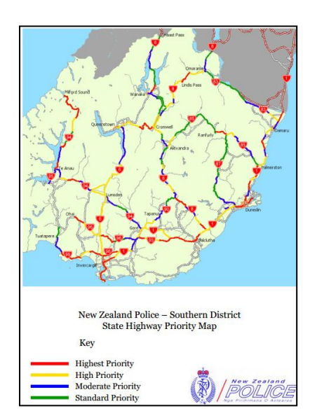
Fig. 6 New Zealand Police – Southern District State Highway Priority Map (NZP, 2012)