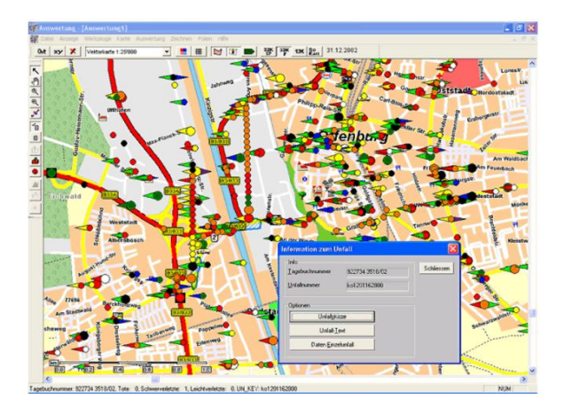
Fig. 7 Geographical viewing of accidents in EUSka (Mauricio C., 2007)