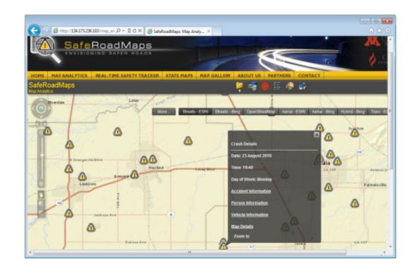
Fig. 2 SafeRoadMaps Map Analytics (SRM, 2012)