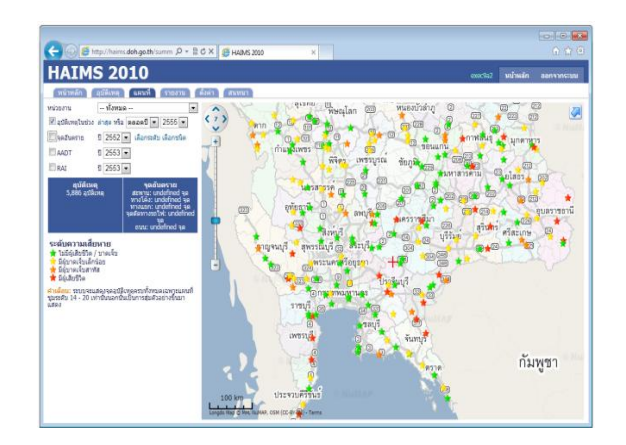
Fig. 8 HAIMS 2010 (DOH, 2012)

In Thailand, Royal Thai Police (RTP) road accident data is often used as representative of road safety situation countrywide. Due to RTP has no official map-based data, Department of Highways (DOH) map-based data named Highway Accident Information Management System (HAIMS) is most popular to identify hazardous location on road network in Thailand.