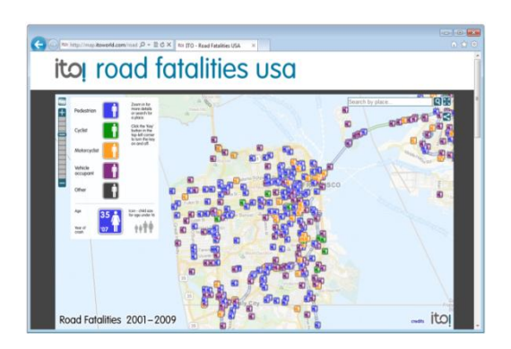
Fig. 1 ITO Road Fatalities USA (ITO, 2012)

presents accident type relating to the situation leading accident. The symbol flag color present the special accident circumstances such as drunk driving, pedestrian involved, motorcycle involved, and accident at a tree.