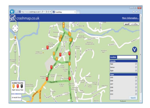
Fig. 4 CrashMap (CrashMap, 2012)