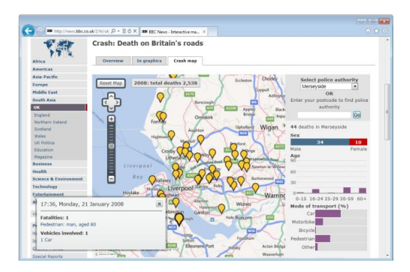
Fig. 3 Crash: Death on Britain's roads (BBC, 2012)